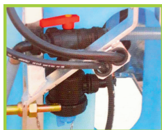
Suction filter with shut-off valve