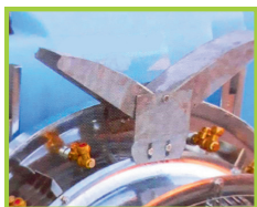
Directional wings to adjust spraying angle