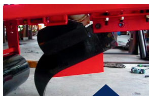
Heavy duty tine mounted with forged reversible steel point for max. soil penetration