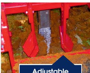
Adjustable mould board to cover back soil