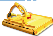
HF SERIES MODEL