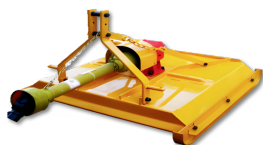
MD SERIES MODEL