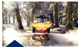
Stainless steel spreading mechanism